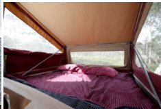
Queen size bed with roof LEDs