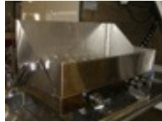
Draft shield for gas burners