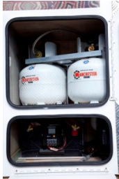
2 x 4kg gas bottles & battery cupboard