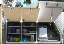
Kitchen cupboards & slide